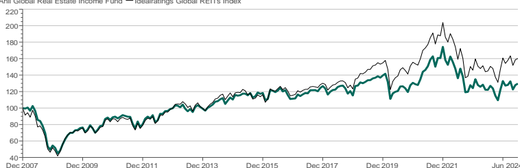
Manager Performance January 2008 - June 2024 (Single Computation) — AlAhli Global Real Estate Income Fund — Idealratings Global REITs Index