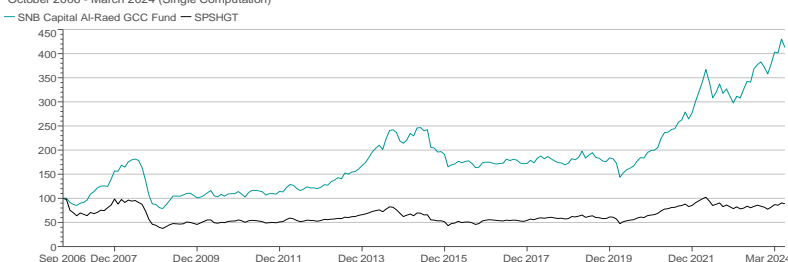
Manager Performance October 2006 - March 2024 (Single Computation)