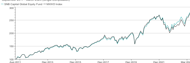
Manager Performance September 2011 - March 2024 (Single Computation)