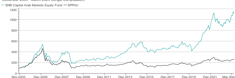
Manager Performance December 2003 - March 2024 (Single Computation)