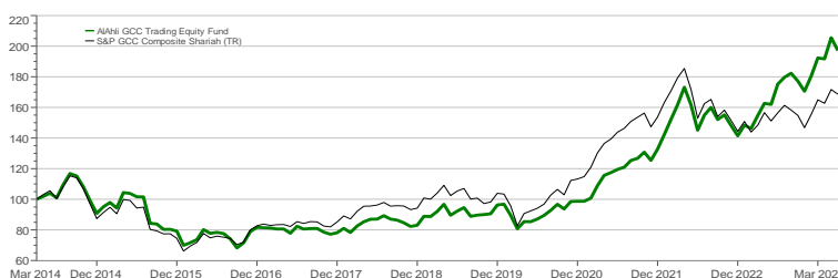
Manager Performance April 2014 - March 2024 (Single Computation)