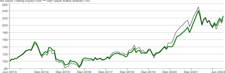
Manager Performance July 2013 - June 2023 (Single Computation) — AlAhli Saudi Trading Equity Fund — S&P Saudi Arabia Shariah (TR)