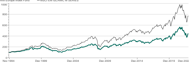
Manager Performance December 1994 - December 2022 (Single Computation) — AlAhli Europe Index Fund — MSCI EM ISLAMIC M SERIES