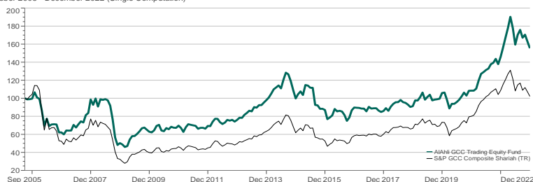
Manager Performance October 2005 - December 2022 (Single Computation)