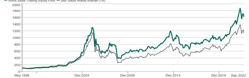
Manager Performance June 1998 - September 2022 (Single Computation) — AlAhli Saudi Trading Equity Fund — S&P Saudi Arabia Shariah (TR)