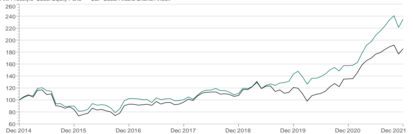
Manager Performance January 2015 - December 2021 (Single Computation) — AIHli Freestyle Saudi Equity Fund — S&P Saudi Arabia Shariah Index