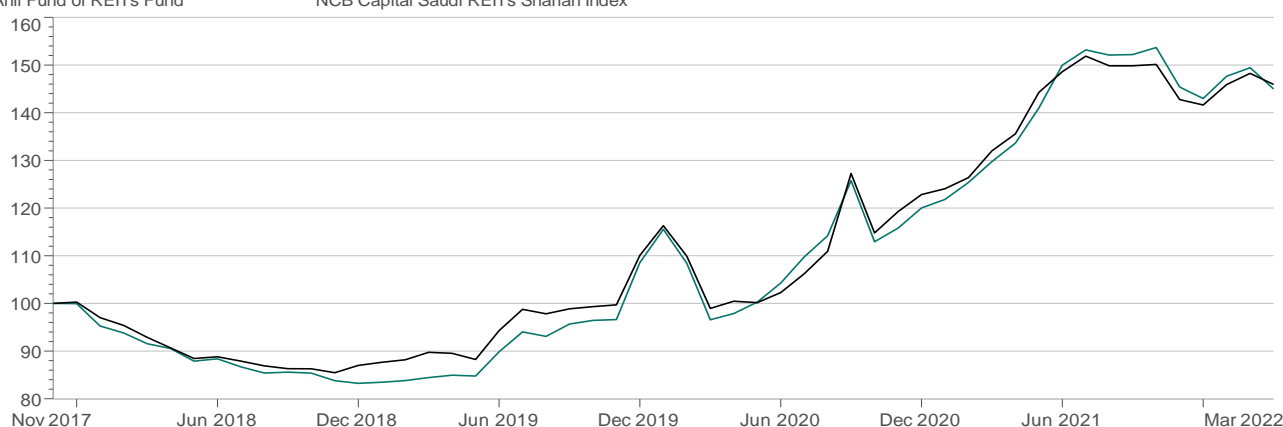
Manager Performance December 2017 - March 2022 (Single Computation) — AlAhli Fund of REITs Fund — NCB Capital Saudi REITs Shariah Index