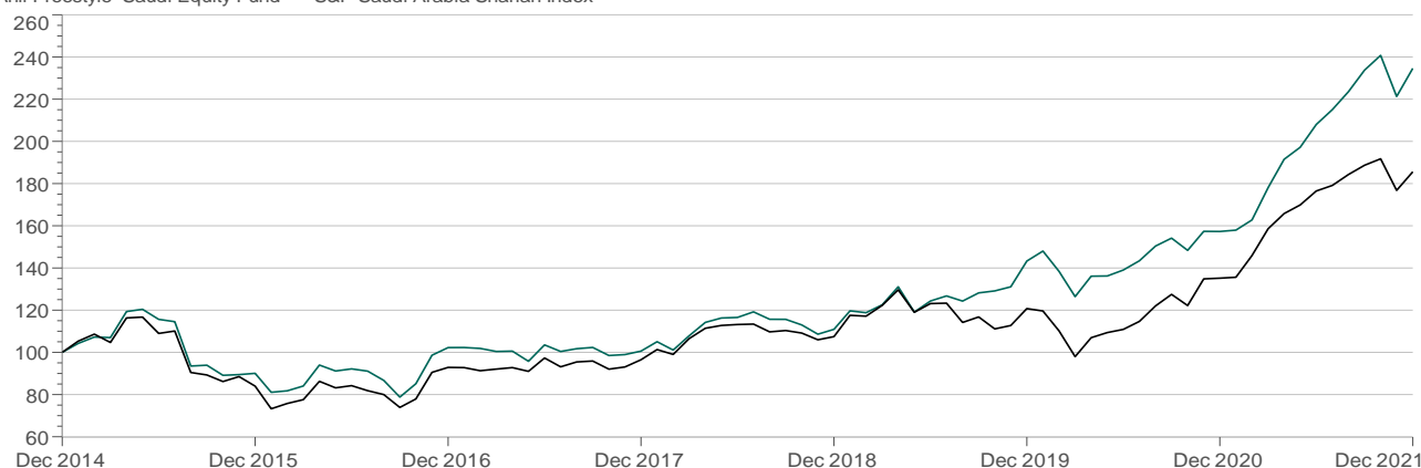
Manager Performance January 2015 - December 2021 (Single Computation) — AIAHli Freestyle Saudi Equity Fund — S&P Saudi Arabia Shariah Index