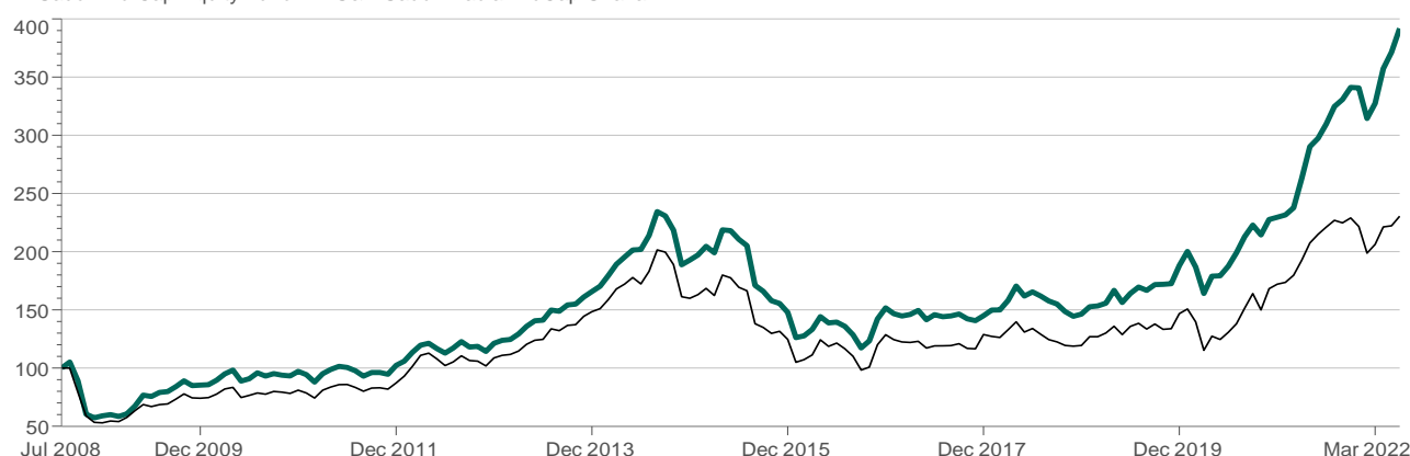
Manager Performance August 2008 - March 2022 (Single Computation) — AlAhli Saudi Mid Cap Equity Fund — S&P Saudi Arabia MidCap Shariah