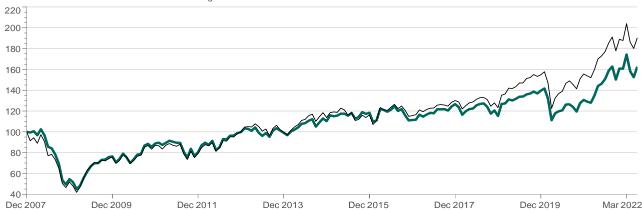
Manager Performance January 2008 - March 2022 (Single Computation) — AlAhli Global Real Estate Income Fund — Idealratings Global REITs Index