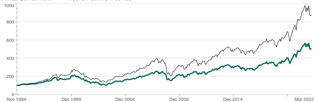
Manager Performance December 1994 - March 2022 (Single Computation) — AlAhli Europe Index Fund — MSCI EM ISLAMIC M SERIES