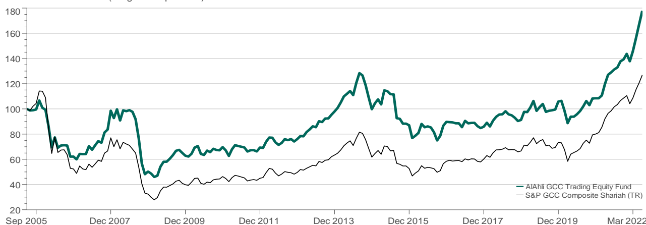
Manager Performance October 2005 - March 2022 (Single Computation)