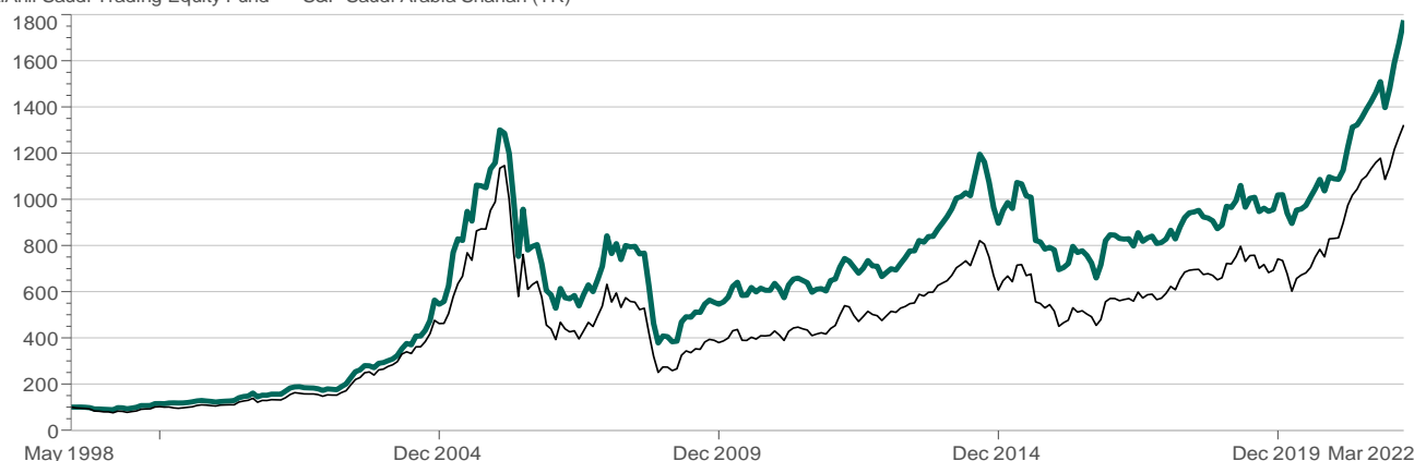
Manager Performance June 1998 - March 2022 (Single Computation) — AlAhli Saudi Trading Equity Fund — S&P Saudi Arabia Shariah (TR)