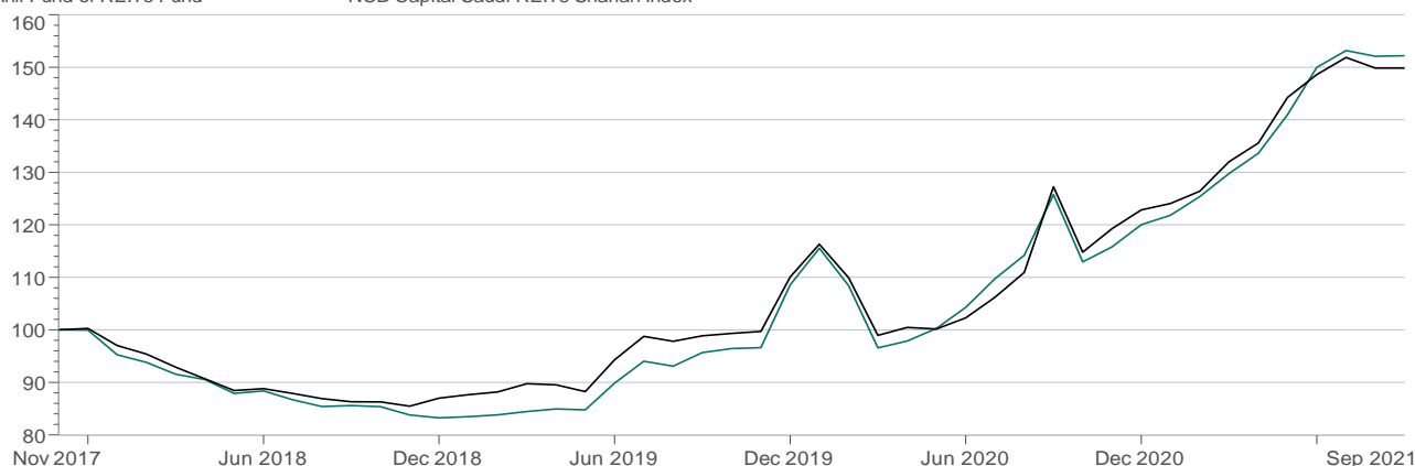
Manager Performance December 2017 - September 2021 (Single Computation) — AlAhli Fund of REITs Fund — NCB Capital Saudi REITs Shariah Index