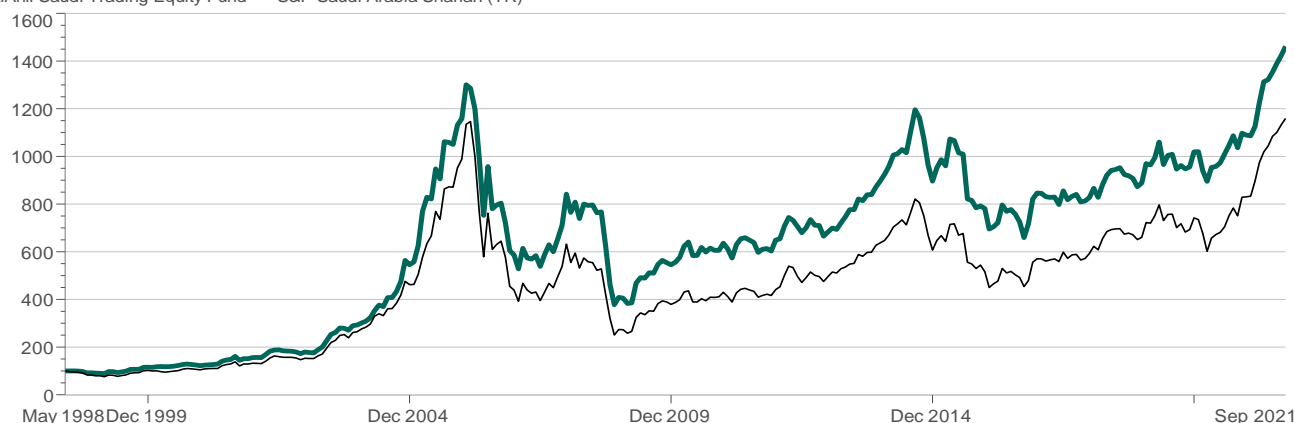
Manager Performance June 1998 - September 2021 (Single Computation) — AlAhli Saudi Trading Equity Fund — S&P Saudi Arabia Shariah (TR)